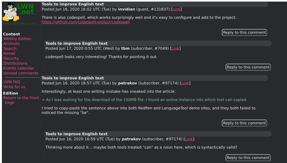
Figure 2: The theme is basically the same as above with slightly lighter headers and a soft green for the quotes

After applying the changes, this is what comments look like: